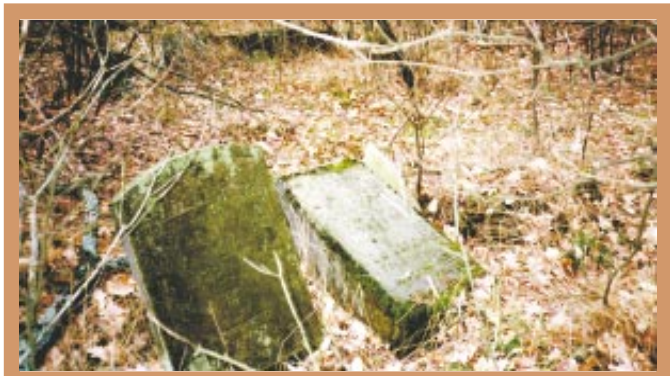
■ Jewish cemetery in Anielin (includes Otwock burials), 1995 3