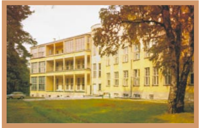
■ Sanatorium (resort), c. 1990 6