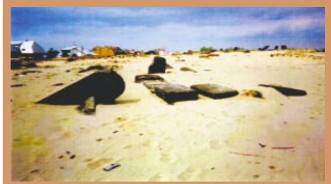
■ Jewish cemetery in Karczew (includes Otwock burials), 1996 4

In nearby village of Anielin The cemetery was established in the nineteenth century. Remaining tombstones: 200, dating from 1915. ul. Szkolna (in nearby Karczew) Remaining tombstones: 50, dating from 1876.