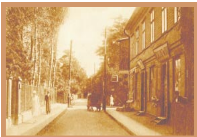
1 | ul. Kościelna, 1929