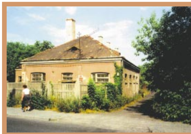
1 | Former synagogue, Bet Midrash Reindorf, ul. Górna 6