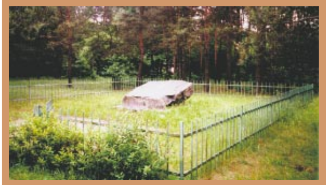
■ Holocaust memorial, ul. Reymonta, 1995 5

Monument at ul. Reymonta, where more than 6,000 Jews in the Otwock ghetto were shot between August 19 and 30, 1942.