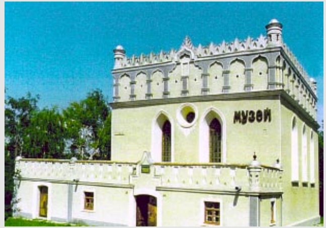
■ Former synagogue, now a museum, 1995 970