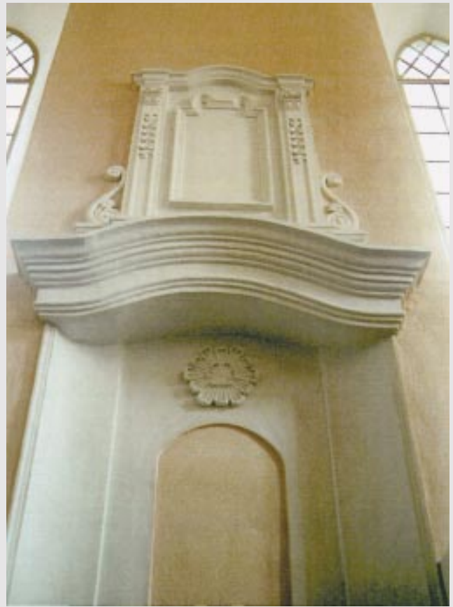
■ Museum (former synagogue) interior, 1995 971