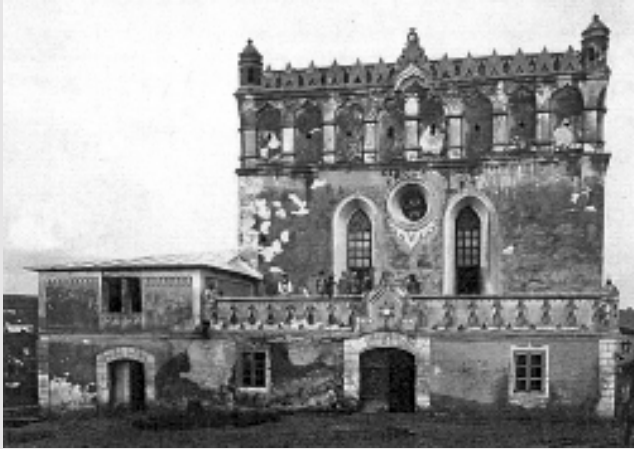
■ Synagogue in Gusyatin, Ukraine, pre-Holocaust 968