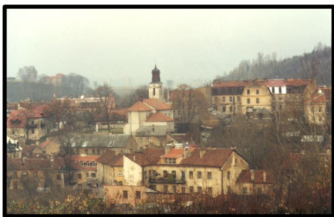
Local view in Vilnius, 2000

These foregoing directories are searchable via an OCR search by clicking here . See page 5-7 for sample telephone & business directory entries.