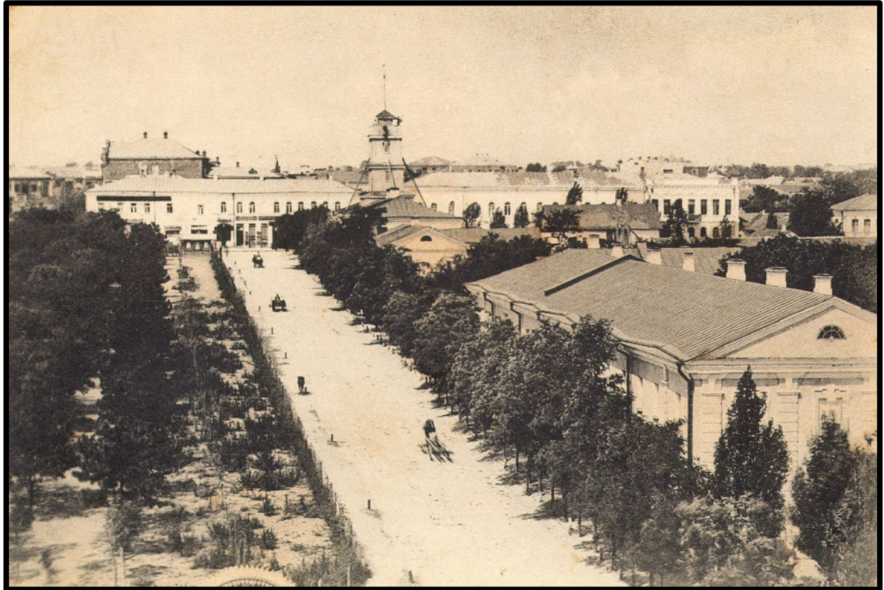
Local view of Uman, c. 1903