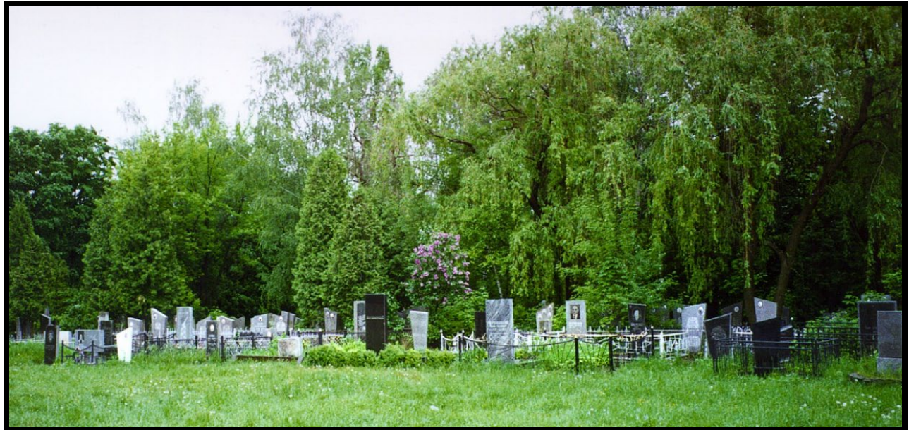
View of portion of Jewish Cemetery in Uman, 1998