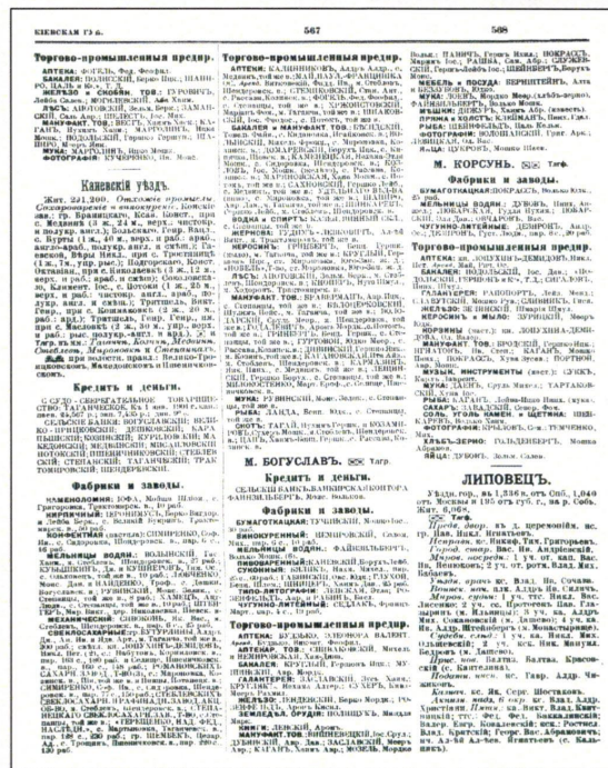
Sample page entry from 1902 business directory, with entries by guberniya (province)