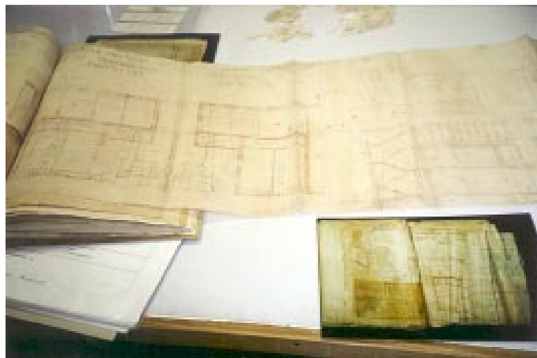
Examples of documents awaiting restoration in the Kaunas Regional Archives, 2000

The main sources of genealogical information for this period in this archive are revision and family lists, where all the members of each family were listed and their age indicated.