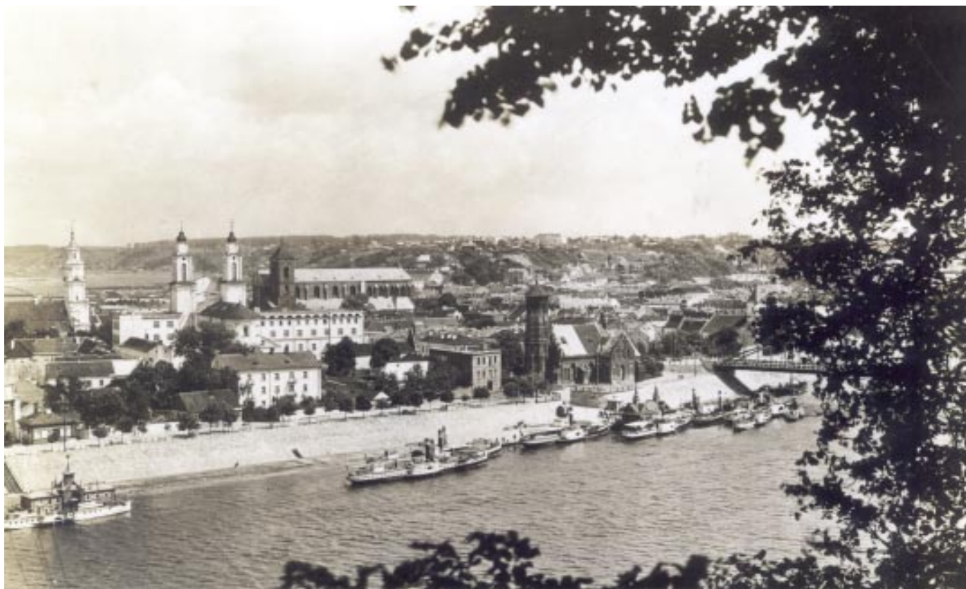
View of the city, 1940

of Kaunas and in some cases, a very small part of Kaunas district.