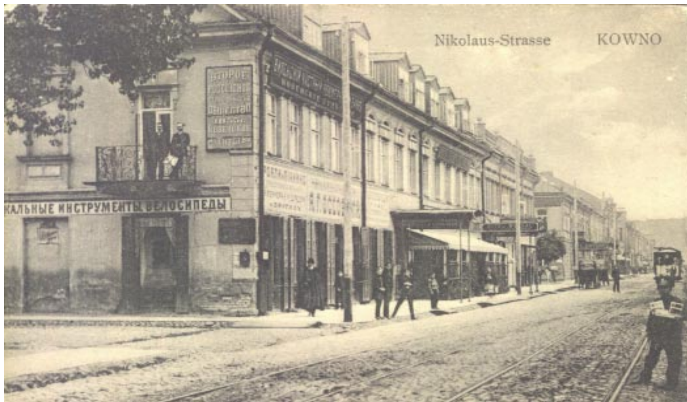
■ Nikolaus-Strasse in Kowno, c. 1919

For the period of 1919–1944, the Kaunas Regional Archives hold only the records of the town of Kaunas and Kaunas district. They contain genealogical information only on the residents