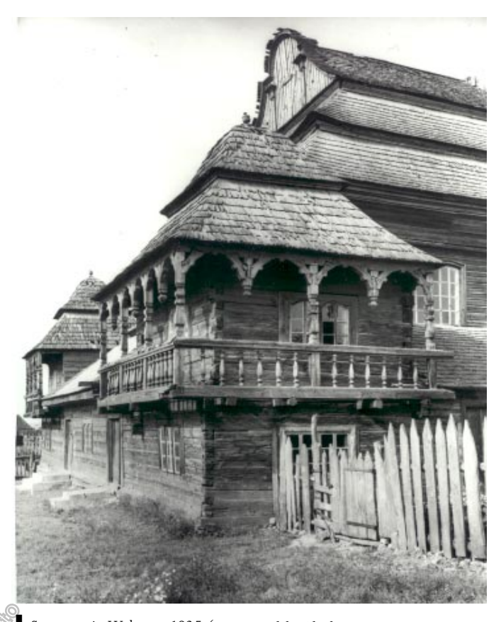
Synagogue in Wolpa, c. 1925