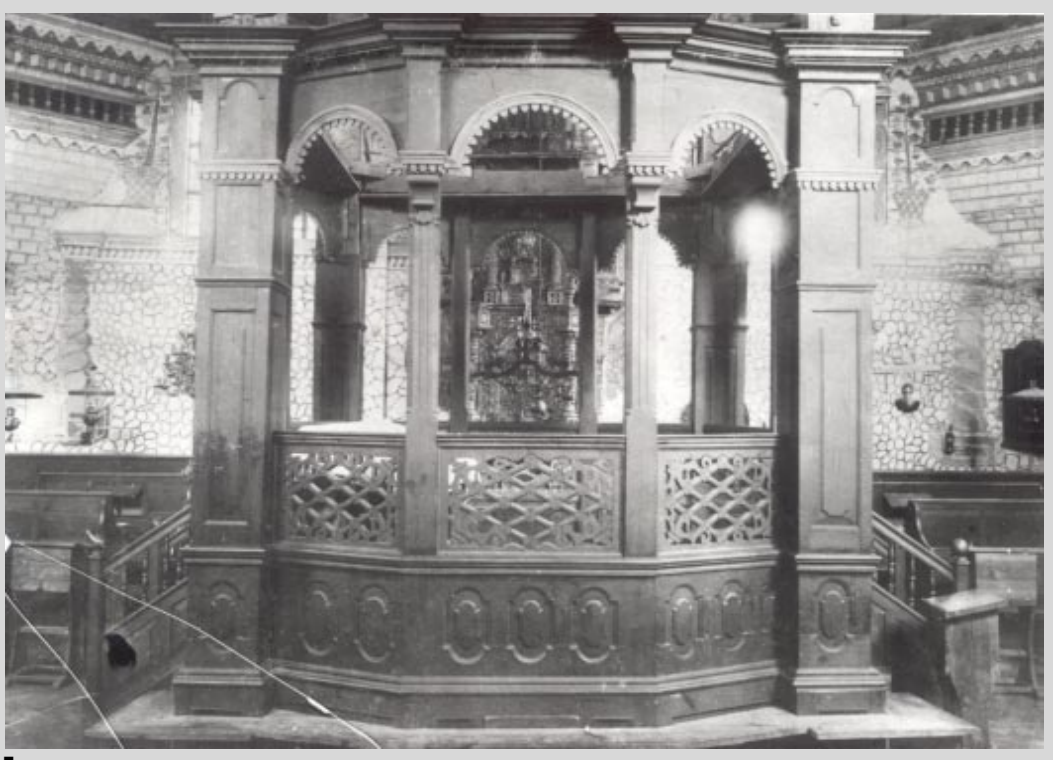
Synagogue in Wolpa, c. 1925